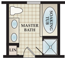
Optional Grand Master Bath