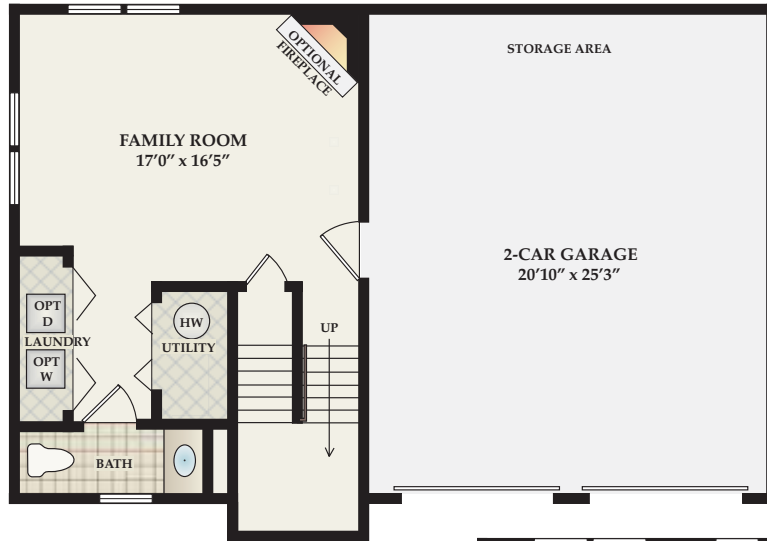
Optional Finished Lower Level