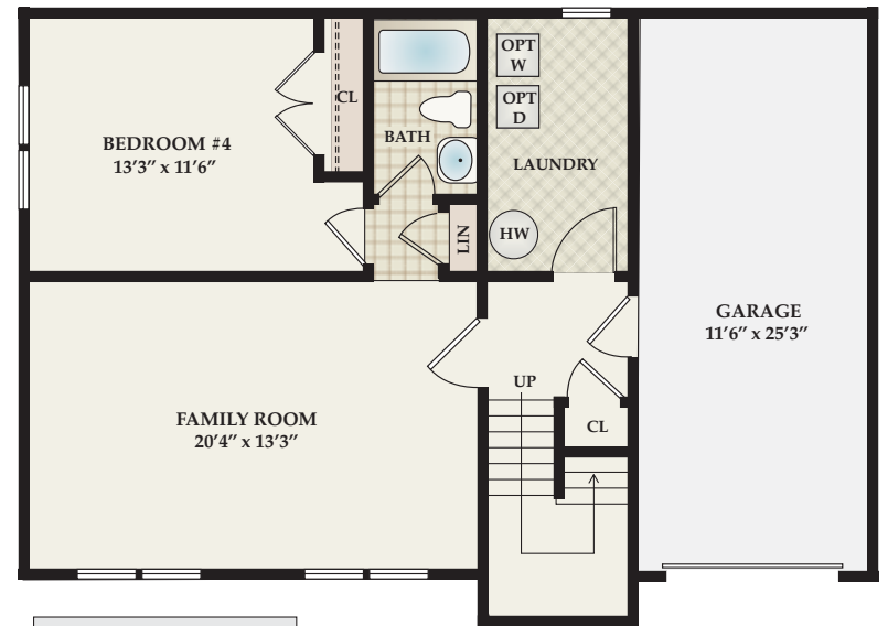
Optional 4th Bedroom on Lower Level