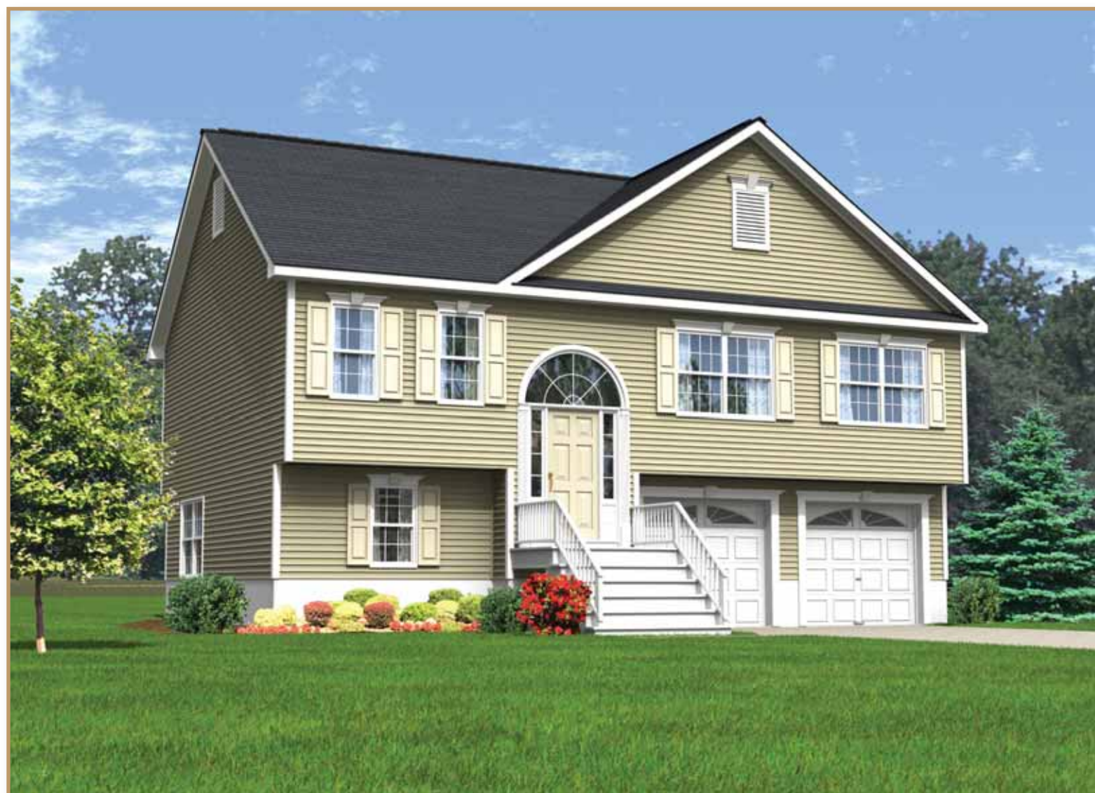
Shown with optional half round window and optional wide window trim