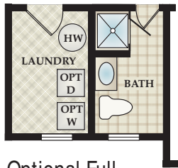
Optional Full Bathroom on Lower Level